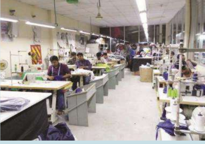
Sampling & Pattern Making