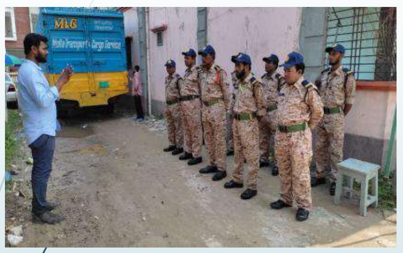
Fire Safety Training Provided by FSCD